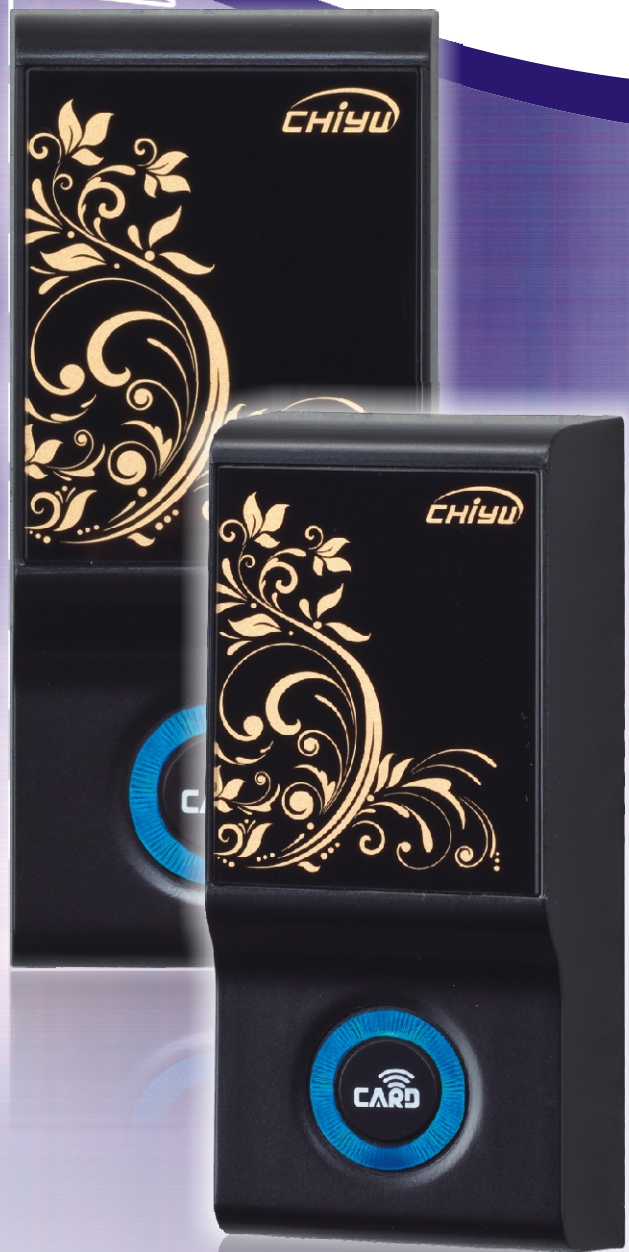
WR-E2/M2 (Black / Silver)