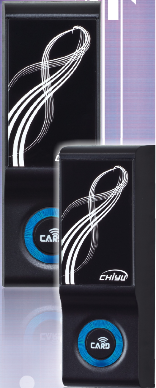
WR-E1/M1 (Black / Silver)